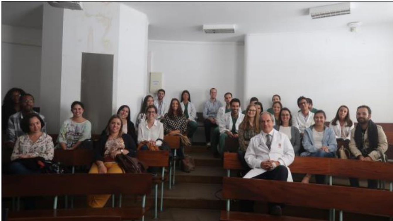
Porto Training Center